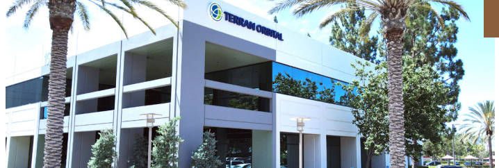
Robotic Module AI&T. Irvine, CA - 37,800 sf