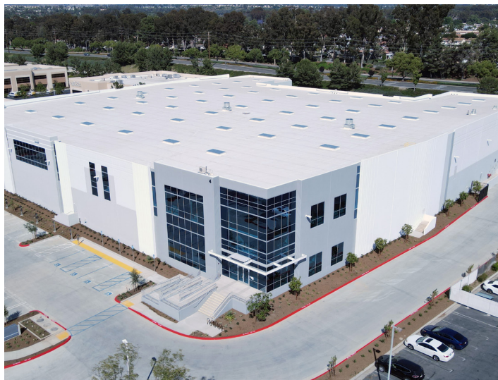
Satellite A&IT. Irvine, CA - 98,000 sf

a class 100,000 clean assembly area, thermal and thermal vacuum chambers, an electronics laboratory for module testing and verification, a large anechoic chamber, a dedicated RF laboratory, random vibration testing equipment, and extensive networking and computing infrastructure. In addition, Tyvak's 4,000-ft 2 dedicated ICD-705-compliant SCIF laboratory space enables assembly and integration of classified payloads at 50 Technology facility. This facility also features walled offices, open cubicle areas, and conference rooms to support over 100 engineering and administrative staff.