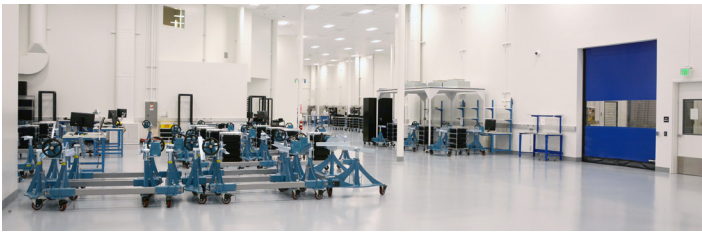
Operated-Guided Subassembly/Satellite AI&T. Irvine, CA - 60,000 sf

Tyvak manufactures tight-tolerance mechanical parts for aerospace applications within its 17,500-ft 2 machine shop located in Santa Maria, CA, which boasts state-of-the-art CNC lathes and mills and precision metrology equipment. Once parts are machined and verified for tolerance, they are shipped to Tyvak's module and subassembly facilities in Irvine, CA, for bus/payload assembly, integration, and testing (AI&T) in our 60,000-ft 2 and 37,800-ft 2 state-of-the-art satellite manufacturing facilities. Within our 50 Technology facility, we house satellite bus assembly, satellite accessory fabrication, test labs with ESD-compliant lab benches, laminar flow benches, electronics and mechanical assembly areas,