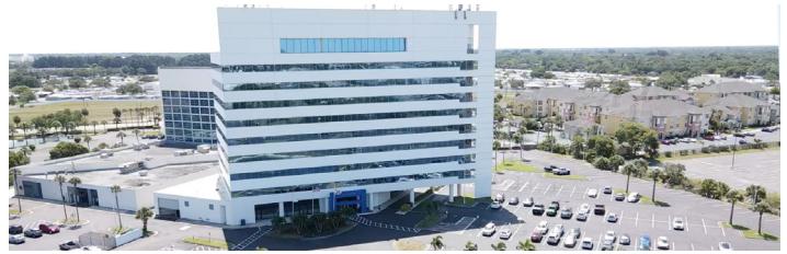
Payload AI&T. Melbourne, FL - 17,200 sf

a class 100,000 clean assembly area, thermal and thermal vacuum chambers, an electronics laboratory for module testing and verification, a large anechoic chamber, a dedicated RF laboratory, random vibration testing equipment, and extensive networking and computing infrastructure. In addition, Tyvak's 4,000-ft 2 dedicated ICD-705-compliant SCIF laboratory space enables assembly and integration of classified payloads at 50 Technology facility. This facility also features walled offices, open cubicle areas, and conference rooms to support over 100 engineering and administrative staff.