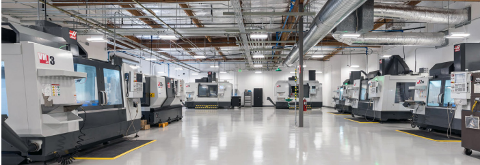
Fabrication and Machine Shop. Santa Maria, CA - 17,500 sf